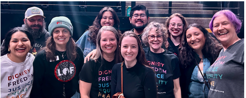
The Advocates staff at the Brandi Carlile concert

In February, Brandi Carlile took the stage at Target Center in Minneapolis in front of an adoring live crowd and a livestream audience on the streaming